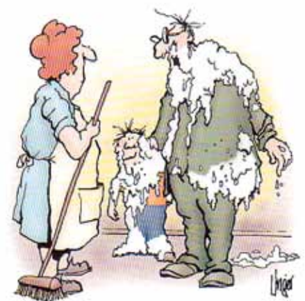
"He opened all the windows halfway through the car wash."

FEBRUARY 13-SPOKANE: "Valentine's Dance & Concert" 1:00-4:00 pm at Centerpoint, 1408 N Washington. Come enjoy Hillyard Belles and the Trainmen while bidding on outstanding silent auctions item! Refreshments served. Tickets $10. Sponsored by Senior Assistance Fund of Eastern Washington (SAFE) Call: (509) 924-6976