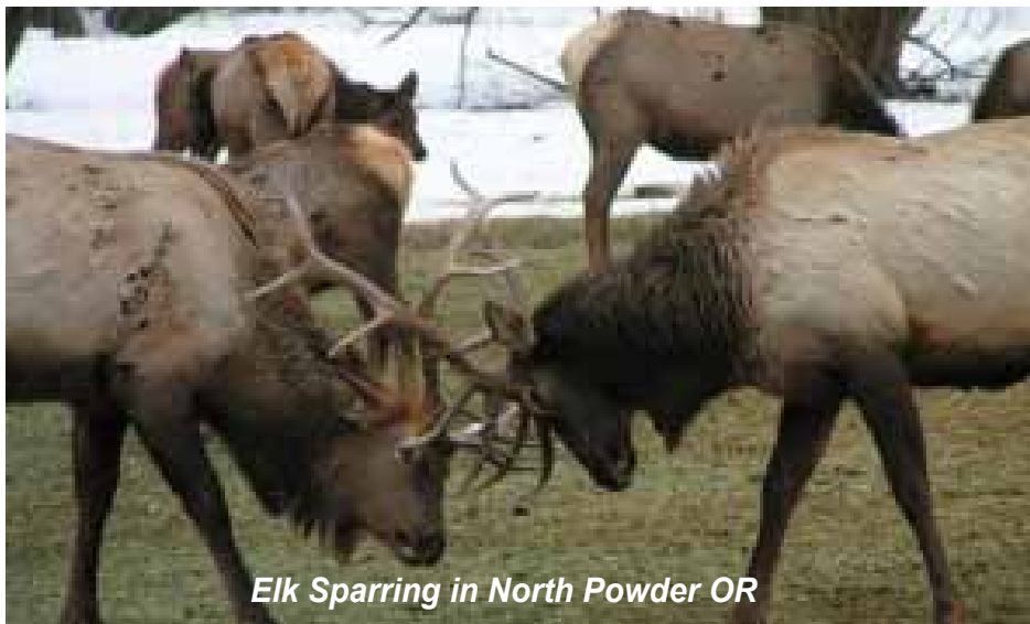
Elk Sparring in North Powder OR