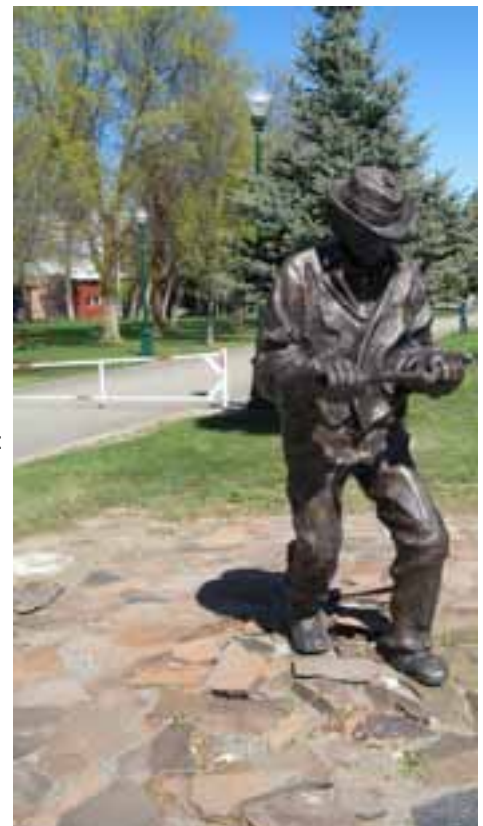
Water Douser standing in front of the Waterville Museum

JUNE 17-WENATCHEE: "BLS Renewal & Annual Clinic Skills Day 2010" Designed to verify competency in specific hands-on skills. Skills Day topics includes: BLS update,