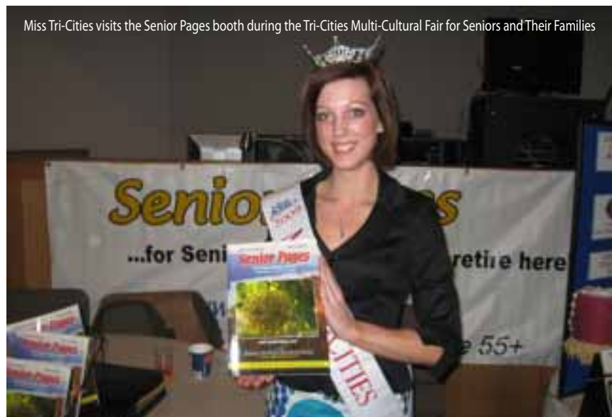
Miss Tri-Cities visits the Senior Pages booth during the Tri-Cities Multi-Cultural Fair for Seniors and Their Families