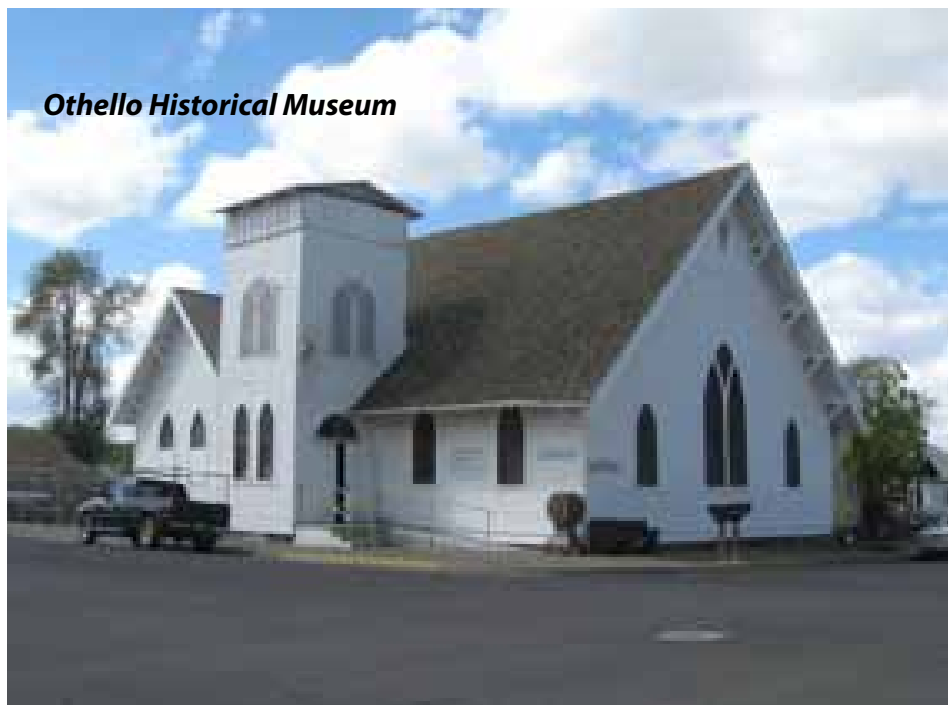
Othello Historical Museum