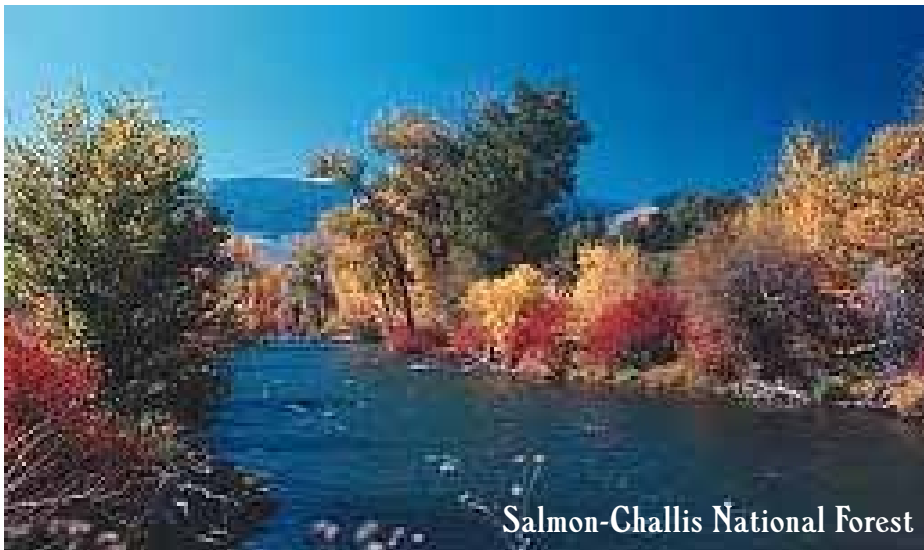
Salmon-Challis National Forest

NOVEMBER 15-MOSCOW: "Osteoporosis Exercise Group" 9:30-11:00 am. One of the best ways to strengthen your bones and prevent osteoporosis is to exercise regularly. Even if you already have osteoporosis, exercise can help you maintain bone mass. Join our ongoing group and improve bone strength. A physician referral is required. To be held at Gritman Medical Center Cardiac Rehab Center. Fee: $6 per session. For more information (208) 883-6088