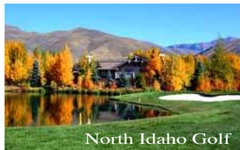
North Idaho Golf