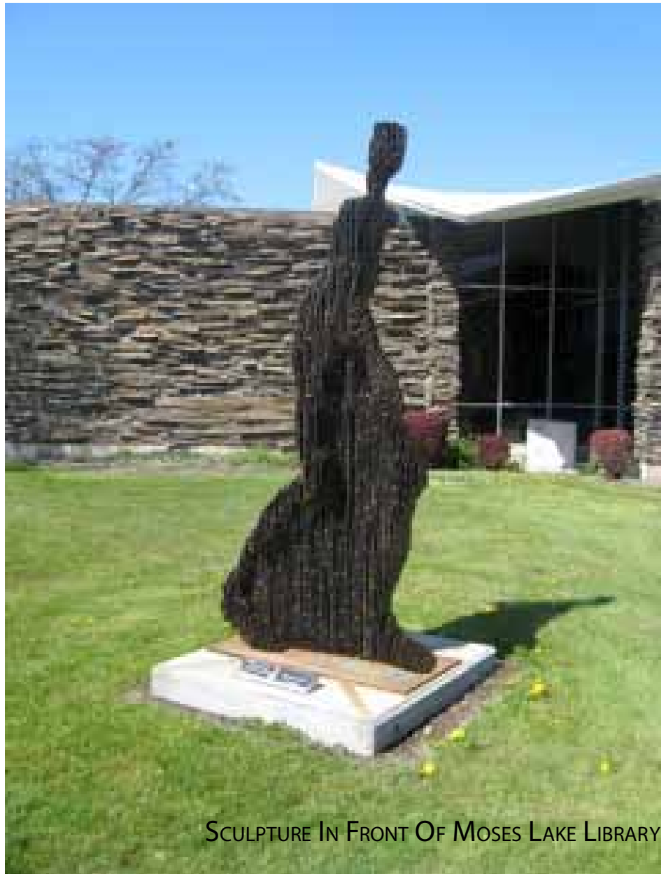
SCULPTURE IN FRONT OF MOSES LAKE LIBRARY

MAY 20-MOSES LAKE: "Healthcare Provider CPR" 8:00 am-Noon. This course is intended for healthcare providers and allied professionals such as physicians, nurses, nursing, medical assistants, etc. Sponsored by Smaritan Healthcare, 801 E Wheeler Rd. Fee: $40. To register by phone or for more informaton please contact the Educaton Center at (509) 793-9690