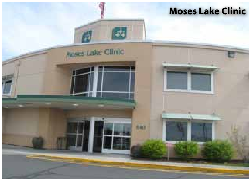
Moses Lake Clinic

Volunteer Tutors Needed: The Southeast Community Center Tutoring Program is currently seeking adult volunteer tutors for youth in grades K-12. Tutors will provide homework assistance and basic tutorials. Training is provided. The Tutoring Program is open from 3:00-5:00