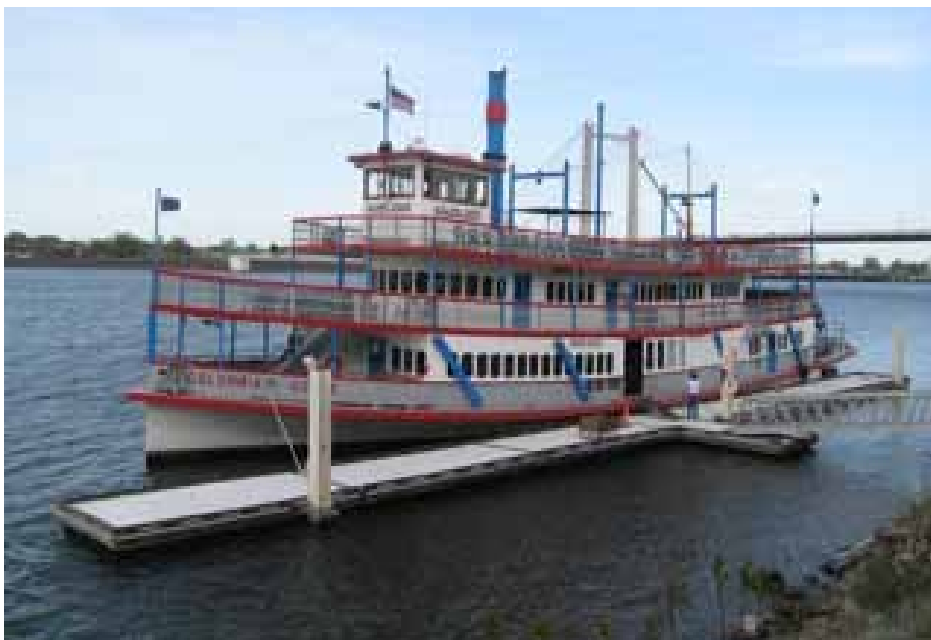
Paddle Wheel Boat Moored At Clover Island Inn during a brief tour of the river.

JUNE 26-MOSES LAKE: "First Aid & CPR" 8:00 am-Noon. Samaritan Healthcare offers First Aid & CPR classes that meet L&I requirements for day care providers, foster care providers, and other job-required card holders. Sponsored by Smaritan Healthcare, 801 E Wheeler Rd. Fee: $40. To register by phone or for more informaton please contact the Educaton Center at (509) 793-9690